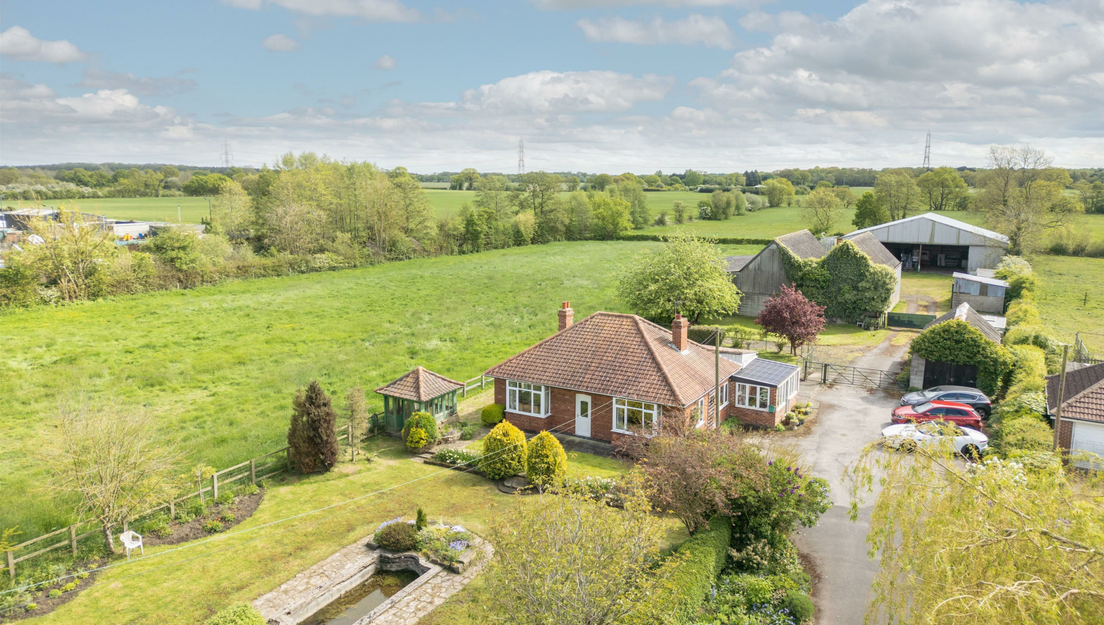
The Nursery, Hull Road | Dunnington, York